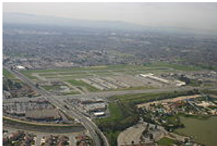
Aerial view of airport from the east