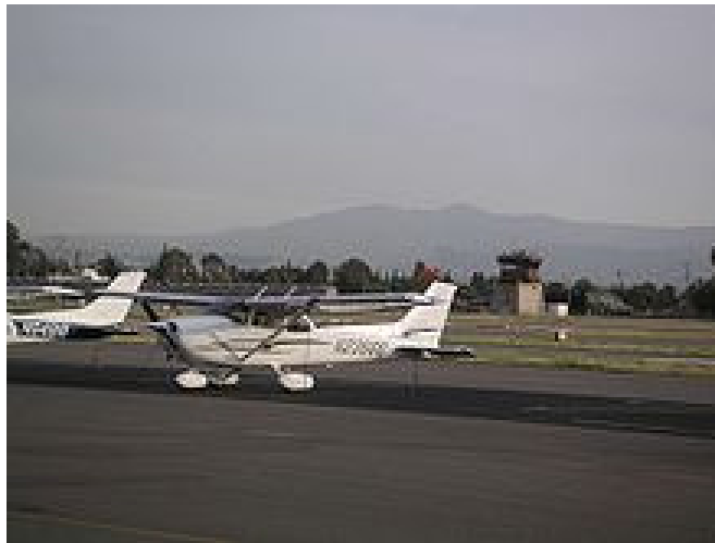
Overlooking transient parking and control tower

Below is a selection of photos of runways and facilities of Reid-Hillview Airport.