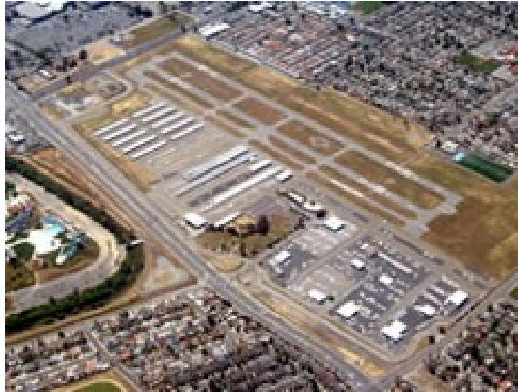
Overhead view of Reid-Hillview Airport